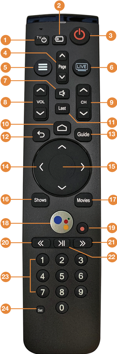
KURV 2.0 Voice Remote Control Shown